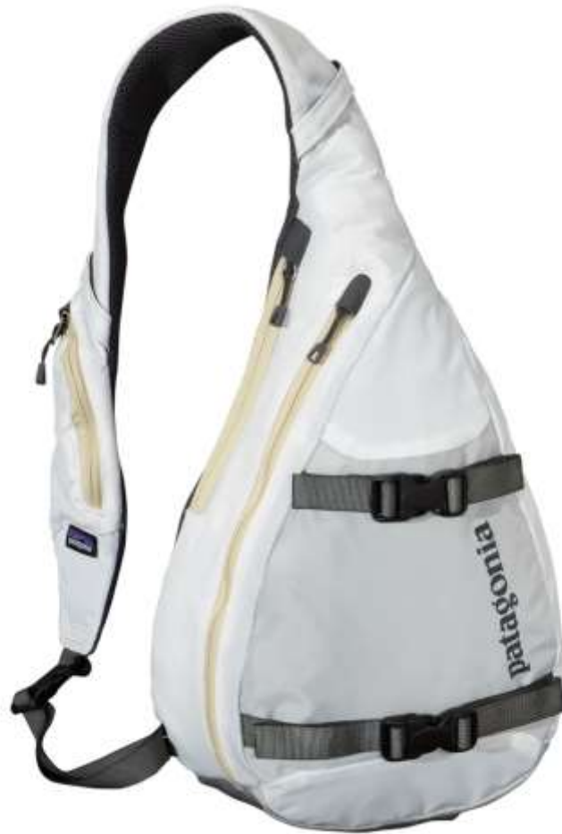
Patagonia Atom Bag 7L